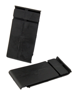
C08PFJIBL Standard Internal Jointer