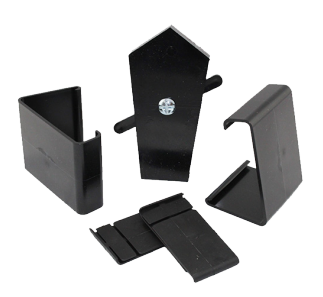
C08PFBL Complete Pack