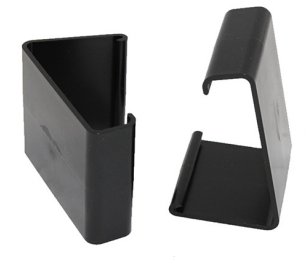
C08PJEBL External Jointer